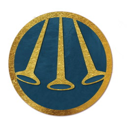
3 sets of 7 judgments (seals, trumpets, bowls)