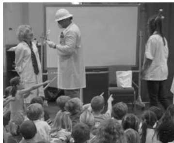
Busted!!! Kids point out the real culprit in drama

One way we helped others during the week was by teaming up with "Nothing but Nets" for our VBS mission project. Over the course of the week, everyone was encouraged to bring $10, which buys one bed net. These bed nets are treated with insecticide Continued on page 4.