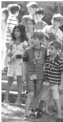
Children enjoy games in the sun.

We had an "explosive" week at Vacation Bible School this year as we "Powered Up" for Jesus! More than 800 kids filled the halls of the church June 9-13 for a fun-filled week complete with drama, snacks, music, games and more! Throughout the week everyone learned about how Jesus gives us the power to be thankful, brave and to help others.