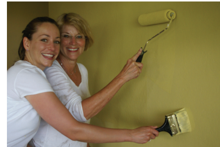
The existing house was improved.