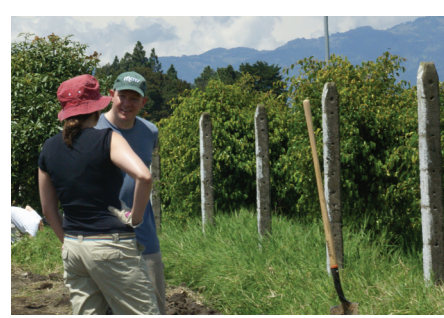
Barbed wire fences were removed.

By the way, the average daytime temperature in San Jose, Costa Rica in February is 75 degrees, and it is one of the least rainy months of the year. It doesn't snow in Costa Rica in February!