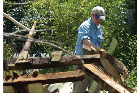
The barn was demolished.