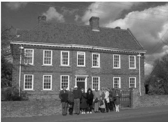
At the Epworth Rectory

Explore for yourself the history of who we are and what we believe by learning about the people and being in the places that gave rise to Methodism. The itinerary includes visits to Epworth (the boyhood home of Methodism's founders, John and Charles Wesley); Oxford (where the Wesleys went to college and began the Methodist movement); Bristol (the site of Methodism's first preaching house and Charles Wesley's home); and London (the spiritual headquarters of Methodism in 18th-century England). We will even be able to worship in Wesley's Chapel on the anniversary of his conversion! Along the way, we will visit and see the sights in historic cities like Lincoln, York and Bath, as well as take in the glorious English countryside.